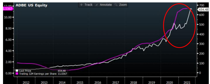
White line – Share price Dark line – EPS growth