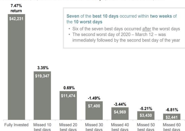
Returns of the S&P 500 Performance of a $10,000 investment between January 2, 2001 and December 31, 2020